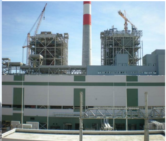
Baodu Comany Profile