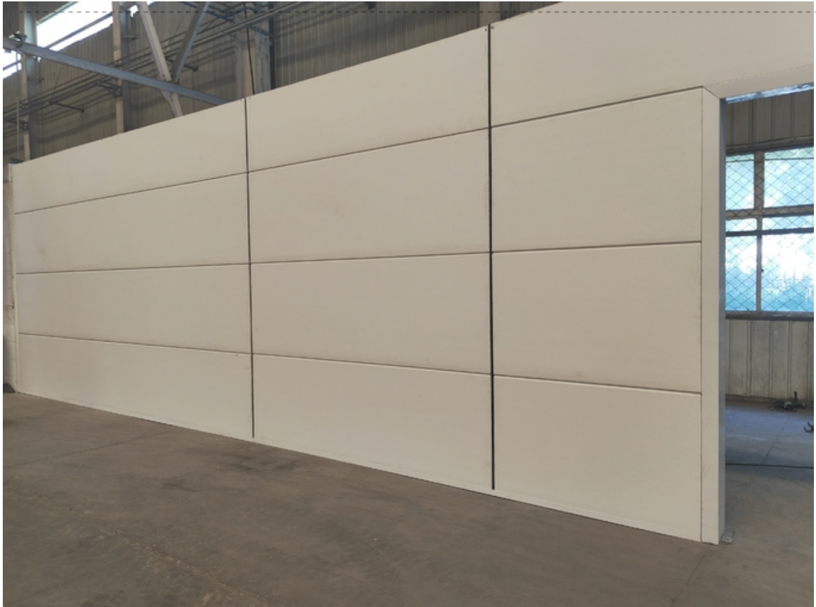
Technical Support and Service for Aluminium Sandwich Panel

Aluminium sandwich panel technical support and service is a priority for us. Our technical experts are available 24/7 to provide you with the best solutions for installation and maintenance of your panel.