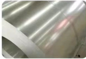
• Zero Spangle •

Customize your Galvanized Steel Coil Z275 or Cold Rolled Gi Coil SS400 Q235 Q345R SA302 SA516 A572 S275 S355 with BAODU. Our steel coils are certified with ISO9001 and CE, ensuring quality and reliability. Minimum order quantity is 1 ton and we offer reasonable prices. Our packaging is standard export waterproof package, suitable for all kinds of transport, or as required. Delivery time is 7 days and we offer flexible payment terms such as L/C, D/A, D/P, T/T, Western Union, and MoneyGram. Our supply ability is 5000 Ton/Tons per month. Customize the surface treatment to your preference, whether it be customized or galvanized. Choose from a variety of grades including SS400, Q235, Q345R, SA302, SA516, A572, S275, and S355. Our cutting method is fly saw tracking cut and we also offer holes punching after profile formed. We also offer matching material in stainless steel such as 309s, 316, 316L, 304, and 321 stainless steel coil.