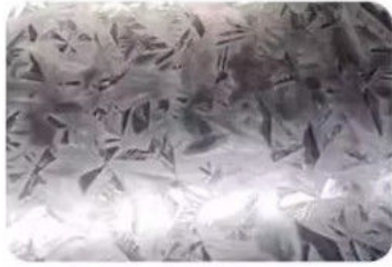
• Big Spangle •