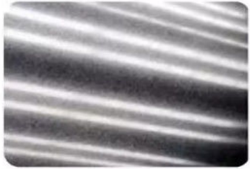
• Mini Spangle •