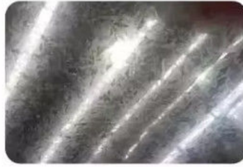
• Regular Spangle •