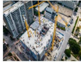
Steel structure building