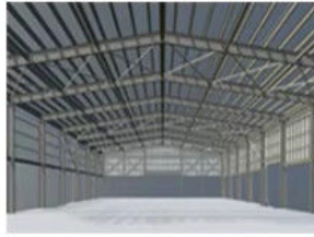
Steel structure factory building