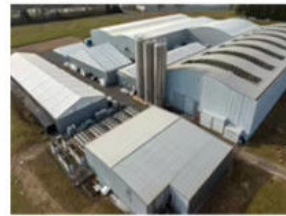
Steel structure livestock house