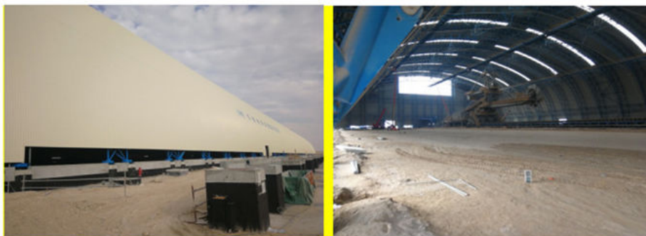
Clean Coal Fired Power Plant Phase I (4x600mw net) Project in Hasyan Dubai

The warehouse steel structure building workshop is made of Q235 and Q355 grade materials, which ensure its durability and long fatigue